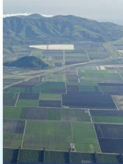
SPOTLIGHT Ventura County Farmworker Housing Study & Action Plan